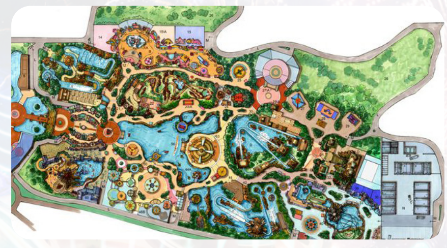
THEME PARK MASTERPLAN

Pon't worry to much about this image being perfect it is just a guide so have fun and make it as imaginative and interesting as possible!