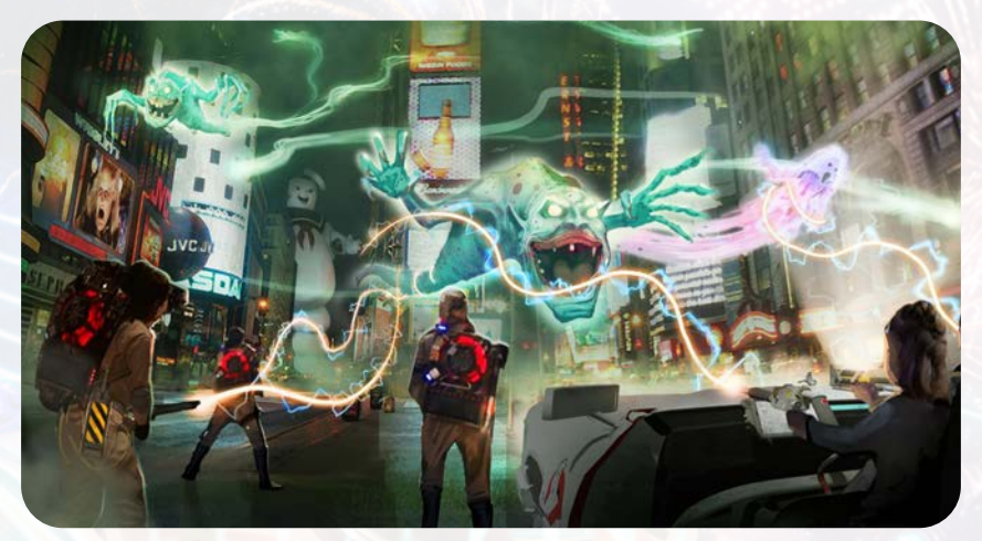
SHOOTING PARK RIDE

Most importantly these rides are telling a story and taking you on a journey. These rides can be funny, scary, thrilling and exiting. You will have to decide what your dark ride will be and where it takes place!